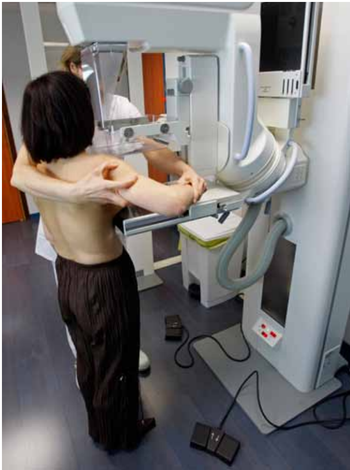
CHECK-UP: A woman undergoes a mammography exam, a type of X-ray of the breasts used to detect tumors, as part of a regular cancer prevention medical check-up at the Ambroise Pare hospital in Marseille, southern France, in April, 2008.

WellPoint also said it created a committee which includes a physician for making rescission decisions. The company also noted that it established a single point of contact for members undergoing an investigation and enacted an appeals process for applicants who disagree with the original determination.